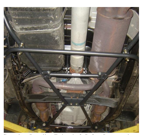
Complete Install w/Driveshaft Safety Loop option