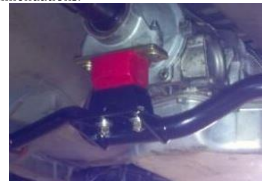
Mounting Sleeve Location (Table 1)

The TH-350 & Power Glide requires additional spacing due to a shorter mounting pad height. Use Stifflers mount adaptor (TM-M02) and Energy Suspension mount (3.1108) in addition to Table3 recommendations.