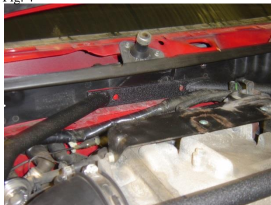
(Mach1 shown, modification of plastic panel is the same)