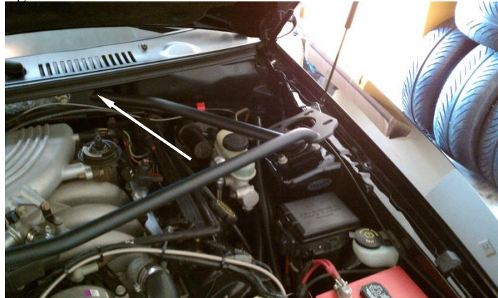
(Bullitt shown, positioning same on Cobra)