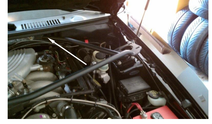
(Bullitt shown, positioning same on Mach1)